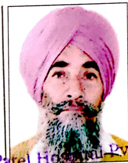
Patel Hospital Pvt. Ltd Jalandhar RECIPIENT

Relation of donor with Recipient..... Brother & Sister