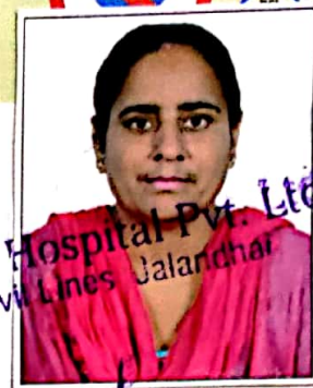
(Photoghrap of Recipient)

Patel Hospital Pvt. Ltd Civil Lines Jalandhar